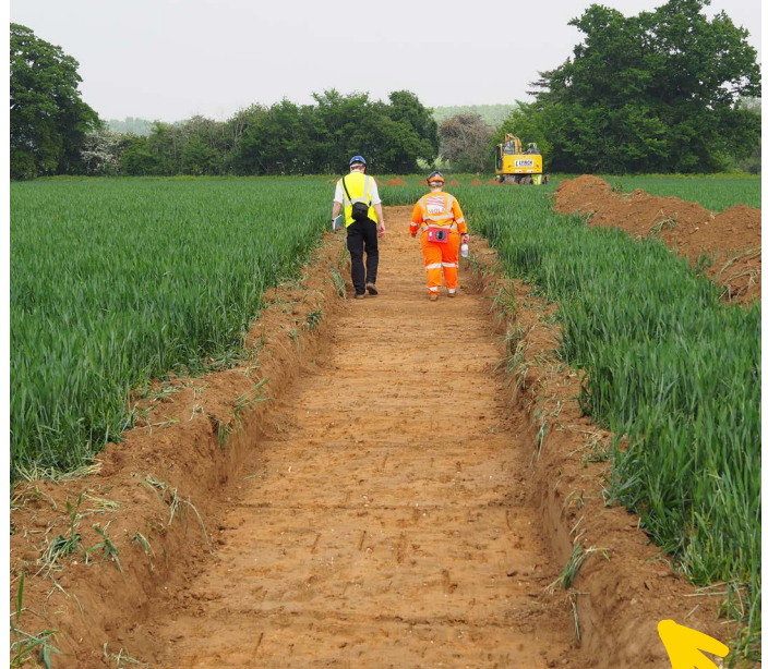
A trench on our Bexwell to Bury St Edmunds route, 2021

A typical archaeological trench is shown above. Reparations are made for crop losses.