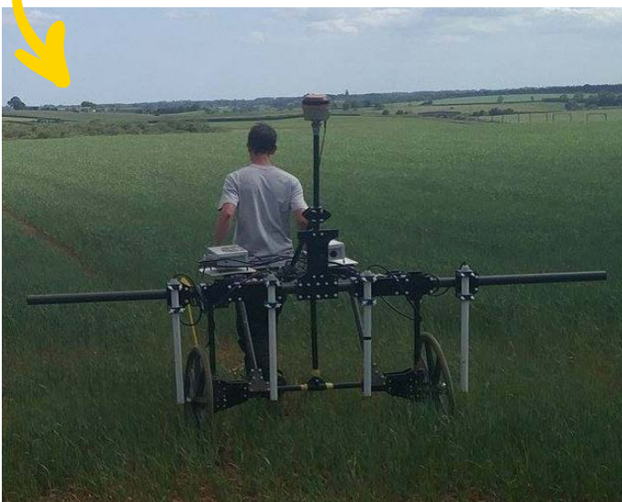
Pull-along cart system

Sometimes for larger, wider areas the land might be suitable for a push or pull-along cart. The cart will be pulled by hand, although it may be pulled by a quad bike. Our teams will take care not to damage the ground.