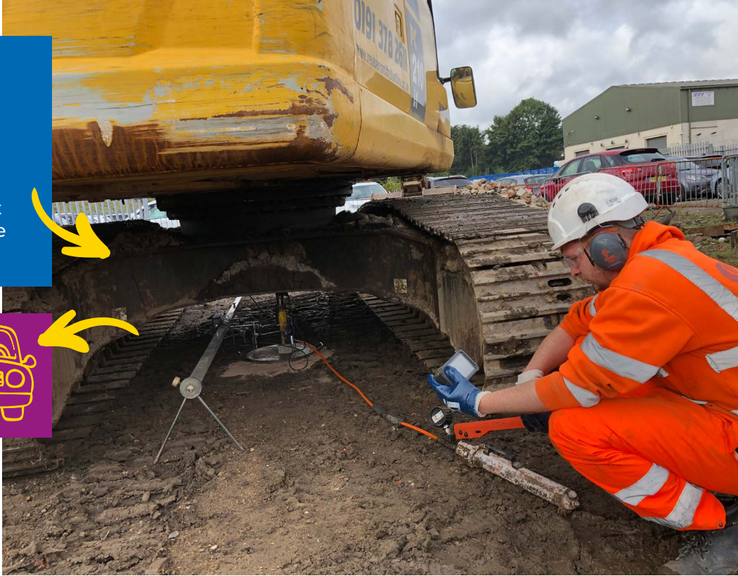
A plate load test