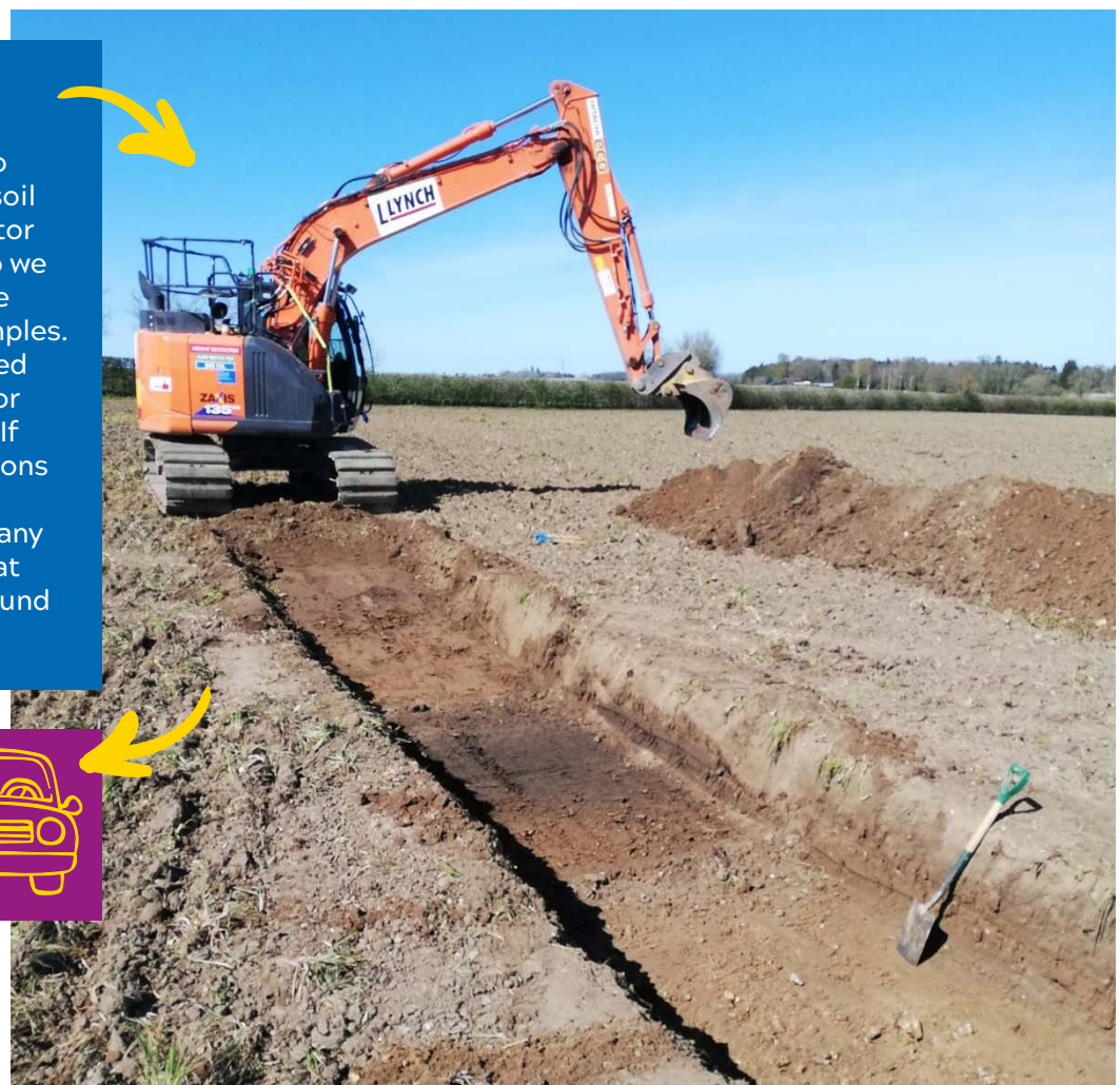
An excavator on our Norwich to Wymondham route