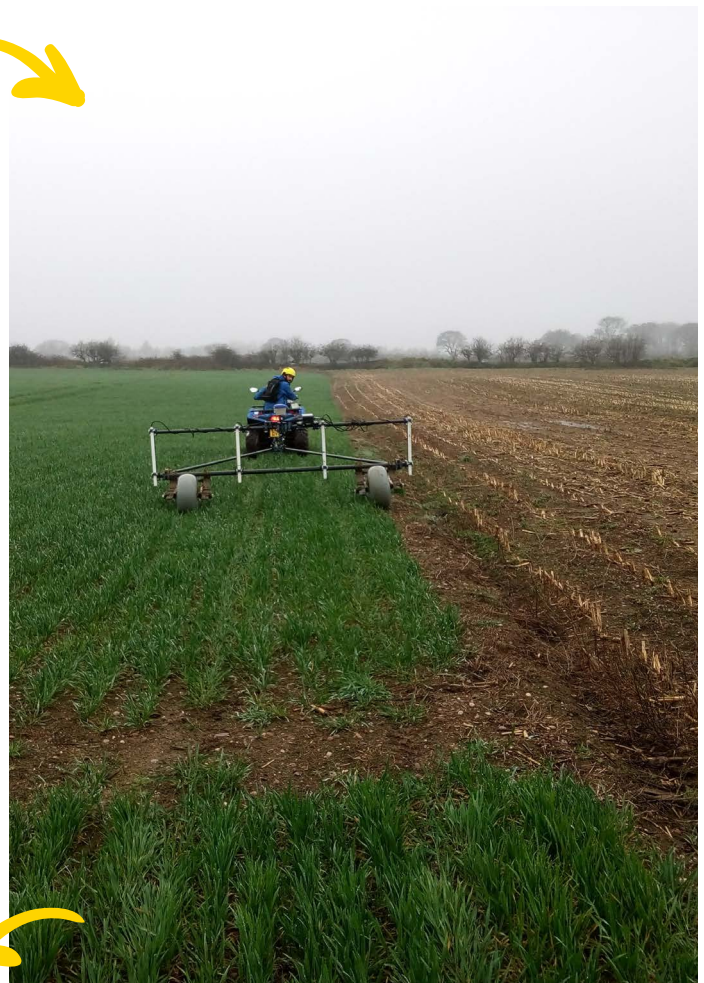
Quad-bike towed cart system