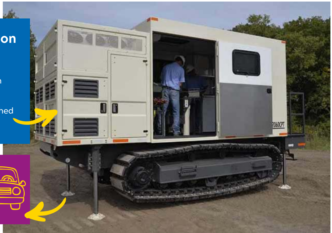
Cone penetration testing truck